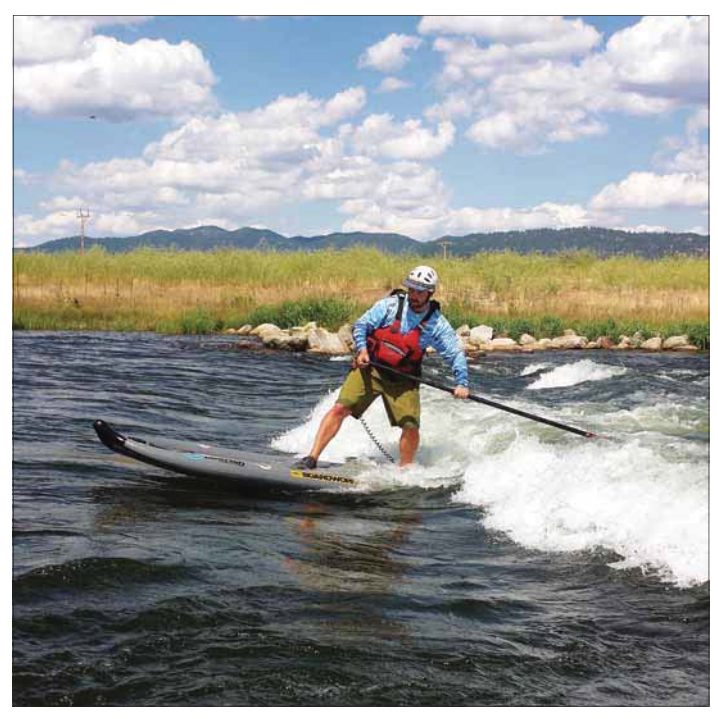
Whitewater surfing with a quick-release leash.

carriage requirements while in a surfing area. However, Minnesota guidelines have created issues near Duluth and the Lester River and Park Point surf breaks. From the Minnesota Department of Natural Resources Boating Guide: