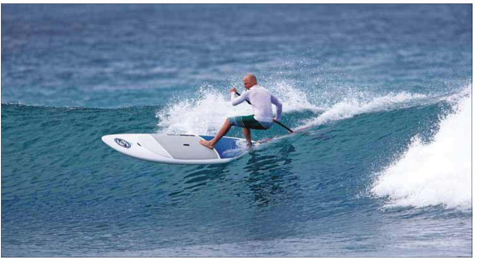
Paddleboarding in the ocean with a straight leash. BIC SUP photo courtesy of Ben Thouard.

The 2008 USCG vessel determination for SUPs appropriately addresses this, as SUPs are exempt from life jacket