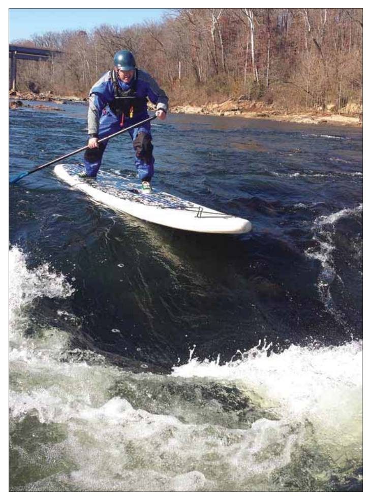
A paddleboarder navigates the rapids on the Rappahannock River in Virginia without a leash.